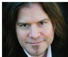
Gregg Kirk Ticked Off Foundation